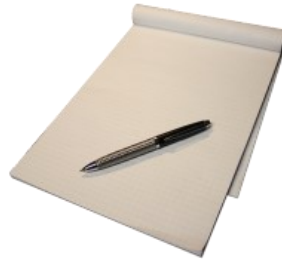
DELEGATE NOTEPADS & PENS