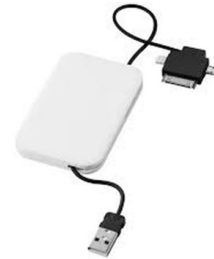
VECTOR 3-IN1 CHARGING CARD