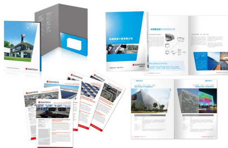
CONGRESS DELEGATE BAG INSERTS