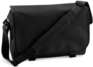
CONGRESS DELEGATE BAG